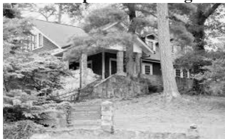
State Office for GFWC-GA