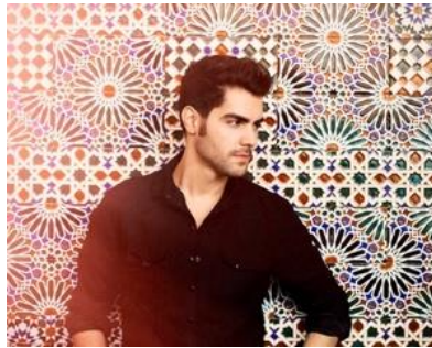
Miloš Karadaglić The Voice of the Guitar

Southern Crescent Chorale Saturday, March 28, 2020 @ 8:00 PM - 10:00 PM Spivey Hall, 2000 Clayton State Blvd, Morrow, GA 30260, USA Saturday, March 28 @ 7:30PM Spivey Hall